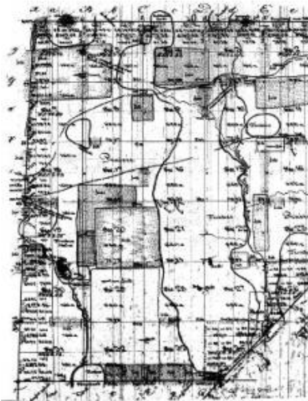
Figure 3. Surveyor's map of Township 38 North Range 10 East showing timber, prairie, roads, and agricultural fields as recorded in 1837. Diagonal line at lower right is part of the northern Indian Boundary.

To complement the notes they took, surveyors sketched a township map showing the watercourses, timber boundaries, and settlement features described in their survey (figure 3). In the course of reviewing the notes for several counties, we have seen many discrepancies between the notes and maps. Our project has relied on the information from the notes supplemented by information from the maps to complete section interior features.