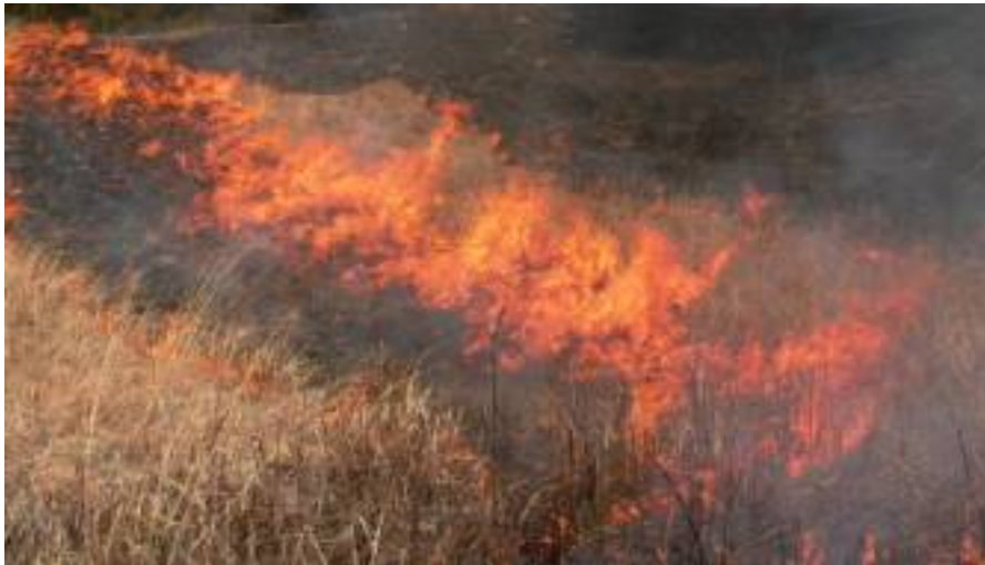
Figure 4. Prescribed burn at a prairie restoration in DuPage County.

look at even earlier vegetation known from this area. Thousands of years ago, the northeastern Illinois landscape was covered with mixed oak and pine forests that had colonized the region following the receding glaciers and gradual warming of the climate. This began to change more rapidly during a warming and drying trend known as the Hypsithermal Interval, which took place between 6000 and 8000 years before present. During that climatic change, fires became frequent and intense, resulting in the gradual deterioration of much of the forests. Surviving timber was most likely to be located on the east side of rivers and other firebreaks, such as topography, where it was protected from the prairie fires that moved, with the wind, from west to east. These fires that led to the forest being replaced by fire-adapted grassland were probably started by indigenous people as well as by lightning. When European settlers arrived, they constructed firebreaks and otherwise did their best to stop the wildfires. The surveyors did mention evidence of fire though: