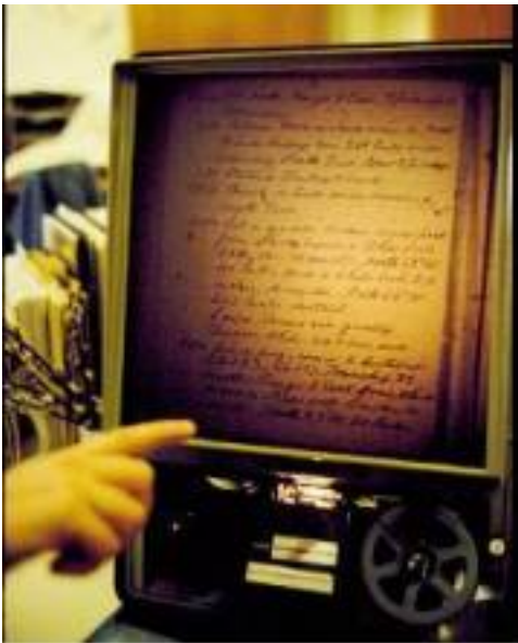
Figure 6. Microfilm copy of survey notes

This has been a delightful project to work on, not only due to the land management information we can glean from it, but also because it's so interesting to read notes written in old script, a real brush with the past (figure 6). And now that we have GIS (Geographic Information Systems) technology, we can bring these historic maps into the digital age and overlay modern maps, aerial photos, soils descriptions, etc. on them.