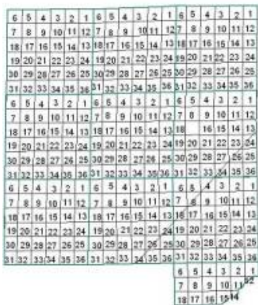
Figure 1. The Township Grid system. DuPage County (pictured) consists of nine complete and one partial township. The diagonal line in the southeast part of the county is one of the Indian Boundaries.

The purpose of the PLS was to make it easier for early European settlers in the United States to identify their land claims, as well as to advise them where to find land “fit for cultivation”. This federal project instituted a grid system made up of townships six miles long by six miles wide, resulting in 36 square-mile sections per township (figure 1). These sections are still regularly referenced in our legal property descriptions.