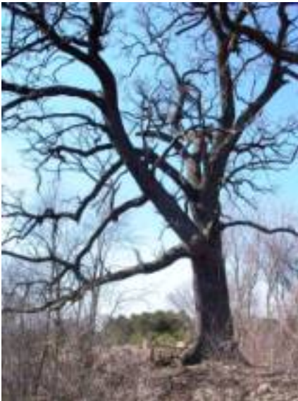
Figure 7. This large bur oak in McHenry County may be an original bearing tree, as it is located at the correct distance and angle from the section corner (marked by a fence post near the tree)

People are always eager to find any bearing trees are still standing. There probably are a few, but many of them were wiped out not too long after the survey, as the following notes attest. Also, being that many section lines became roads, bearing trees often found themselves in the way of automobiles.